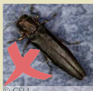
Bronze Birch Borer