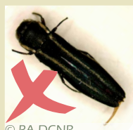
Two-lined Chestnut Borer