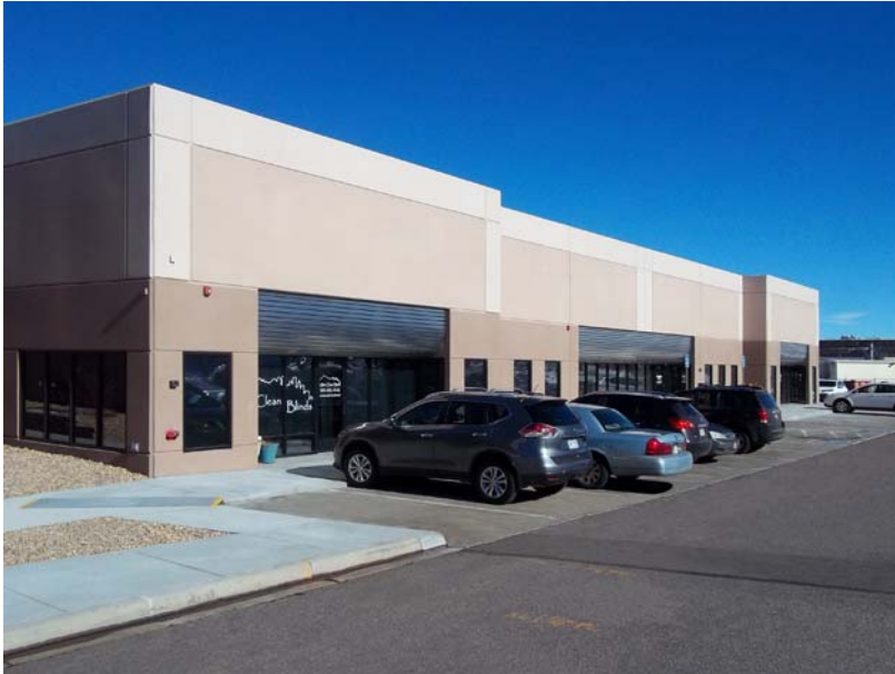
ALL photography, BOTH sides | Copyright © 2017 by J. Barry Winter | All Rights Reserved