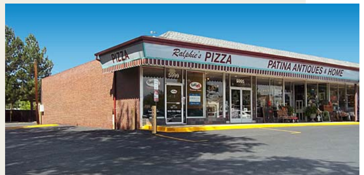
Rare Cherry Crest Endcap now available

With high visibility and easy access off the busy University Blvd within a well-established neighborhood in the affluent community of Greenwood Village, the Cherry Crest Shopette is a popular destination. This convenient center provides many local services, as well as a number of popular restaurants.