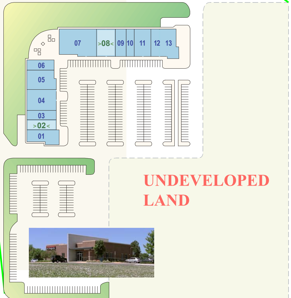
Site plan not drawn to scale