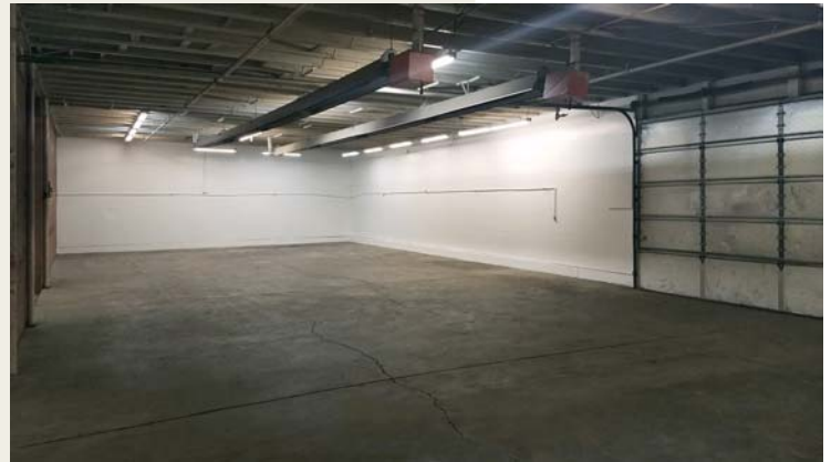
all interior photography | Copyright © 2018 by Lev Cohen | All Rights Reserved