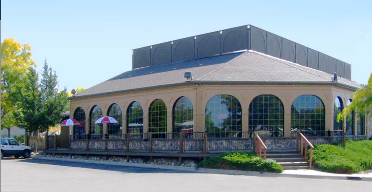
All photography both sides | Copyright © 2008 by J. Barry Winter | All Rights Reserved