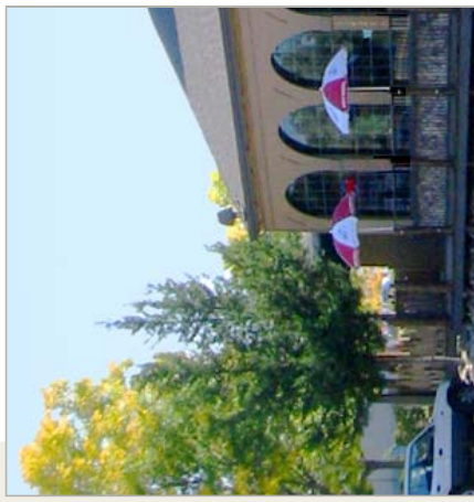
Photography | Copyright © 2008 by J. Barry Winter | All Rights Reserved