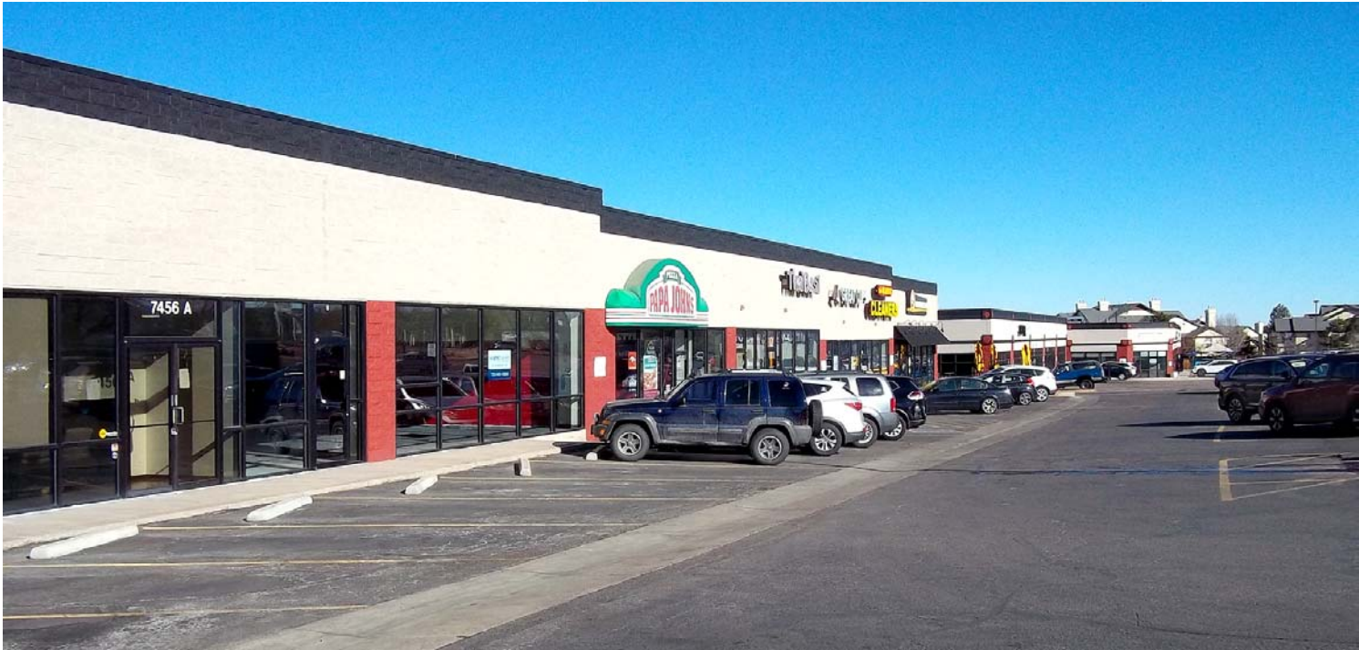
All photography both sides | Copyright © 2020 by J. Barry Winter | All Rights Reserved

7456 South Simms Street, Littleton, Colorado