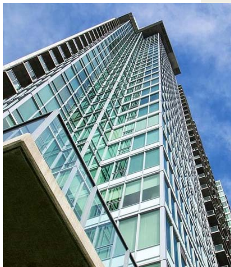
891 SPIRE, high-rise condominium community

All photography all sides | Copyright © 2020 by J. Barry Winter | All Rights Reserved