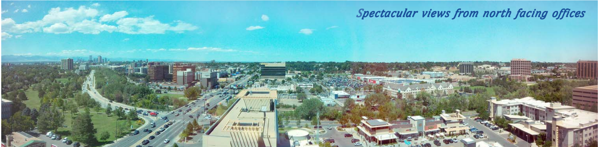
Spectacular views from north facing offices

720 S Colorado Blvd, Suite 1120 N, Denver, Colorado 80246