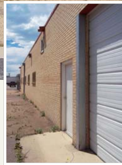
exterior photography