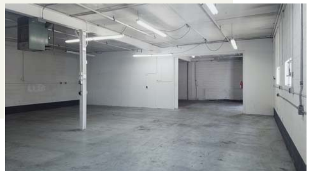
interior photography | Copyright © 2018 by Lev Cohen | All Rights Reserved