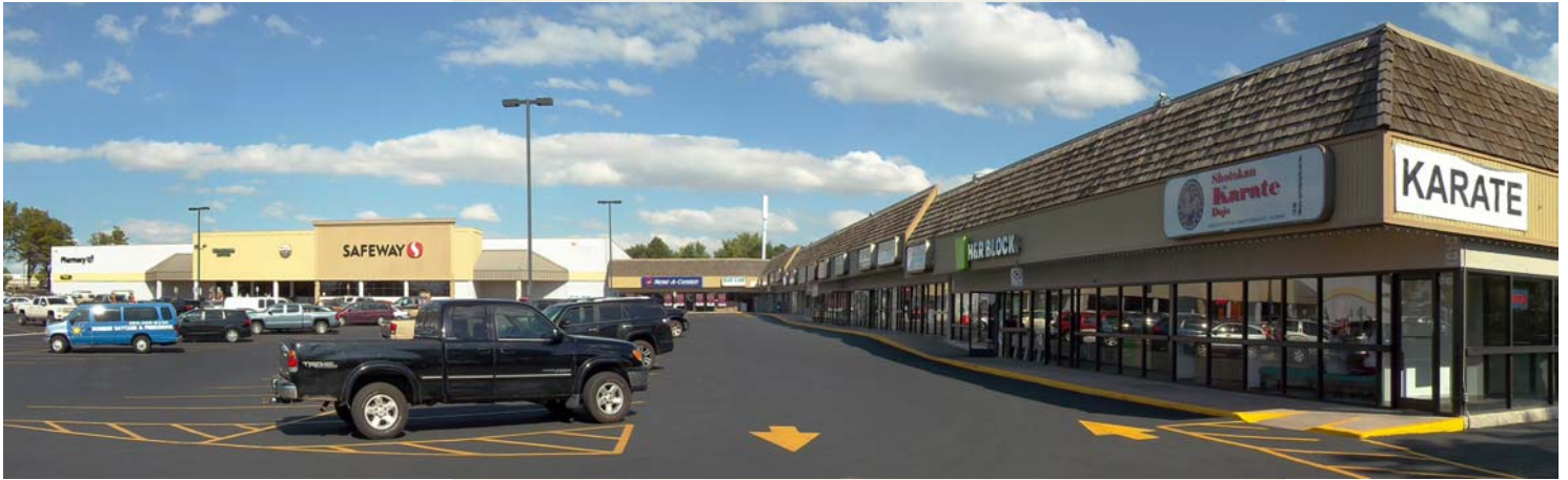
all photography all pages | Copyright © 2021 by J. Barry Winter | All Rights Reserved