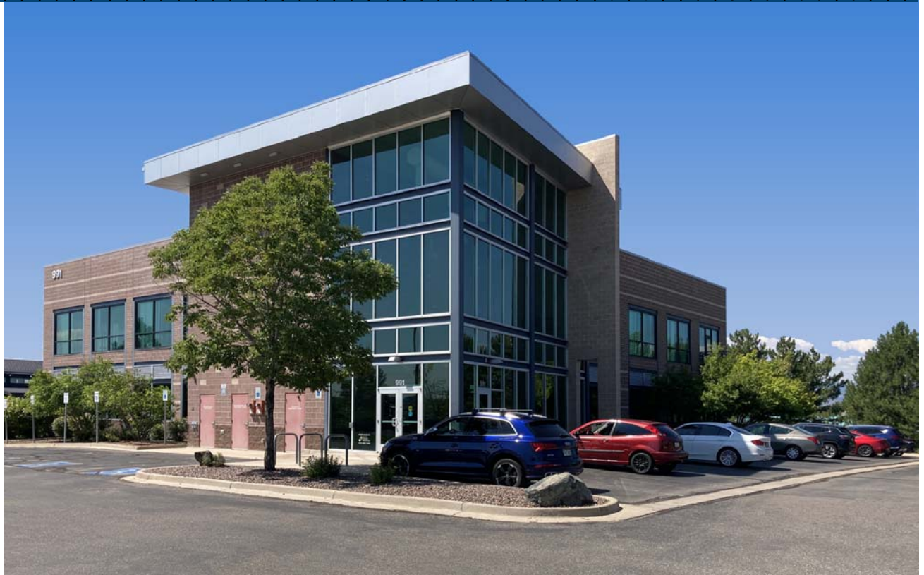
All photography both pages | Copyright © 2022 J Barry Winter | All Rights Reserved