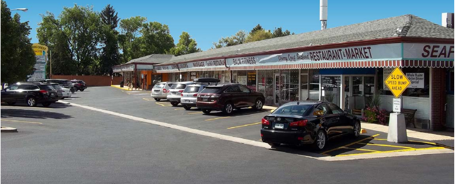
All Photography on all pages | Copyright © 2022 J. Barry Winter. All Rights Reserved

Rare Restaurant and End Cap Space Now Available