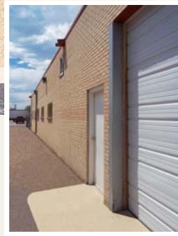
exterior photography