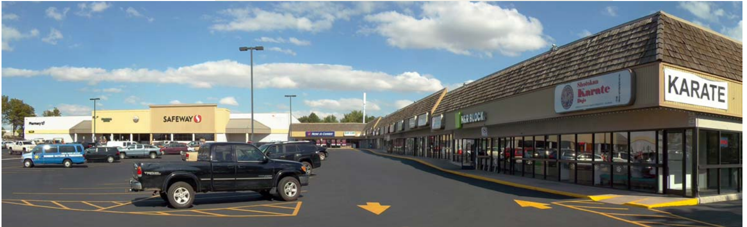
all photography all pages | Copyright © 2021 by J. Barry Winter | All Rights Reserved