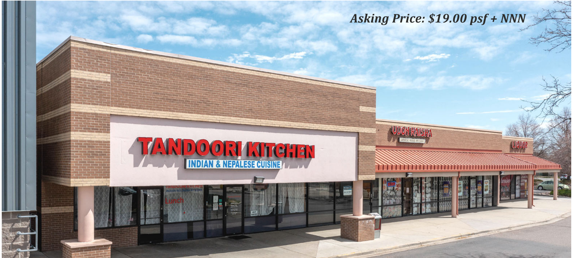
costar/jbw-modified image | Copyright © 2024 J. Barry Winter | All Rights Reserved