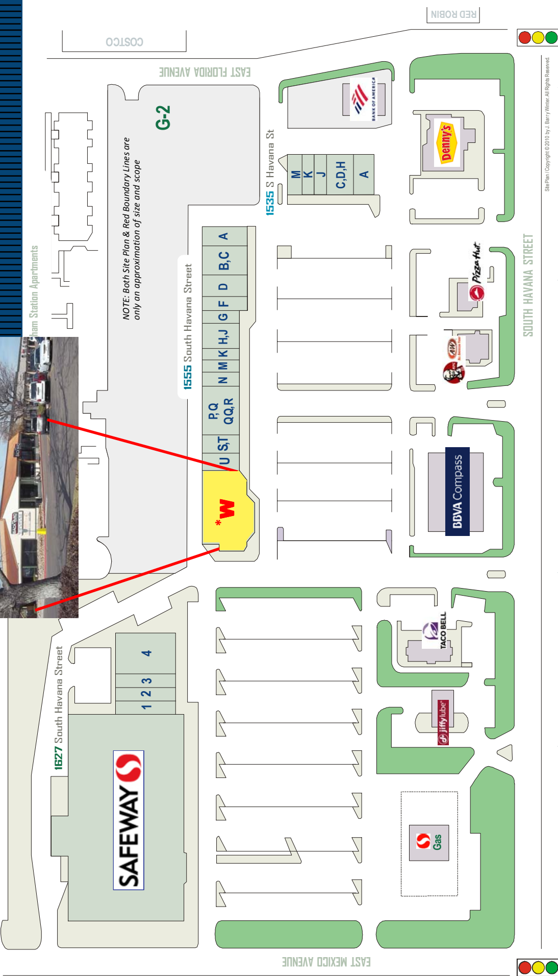
Ham Station Apartments