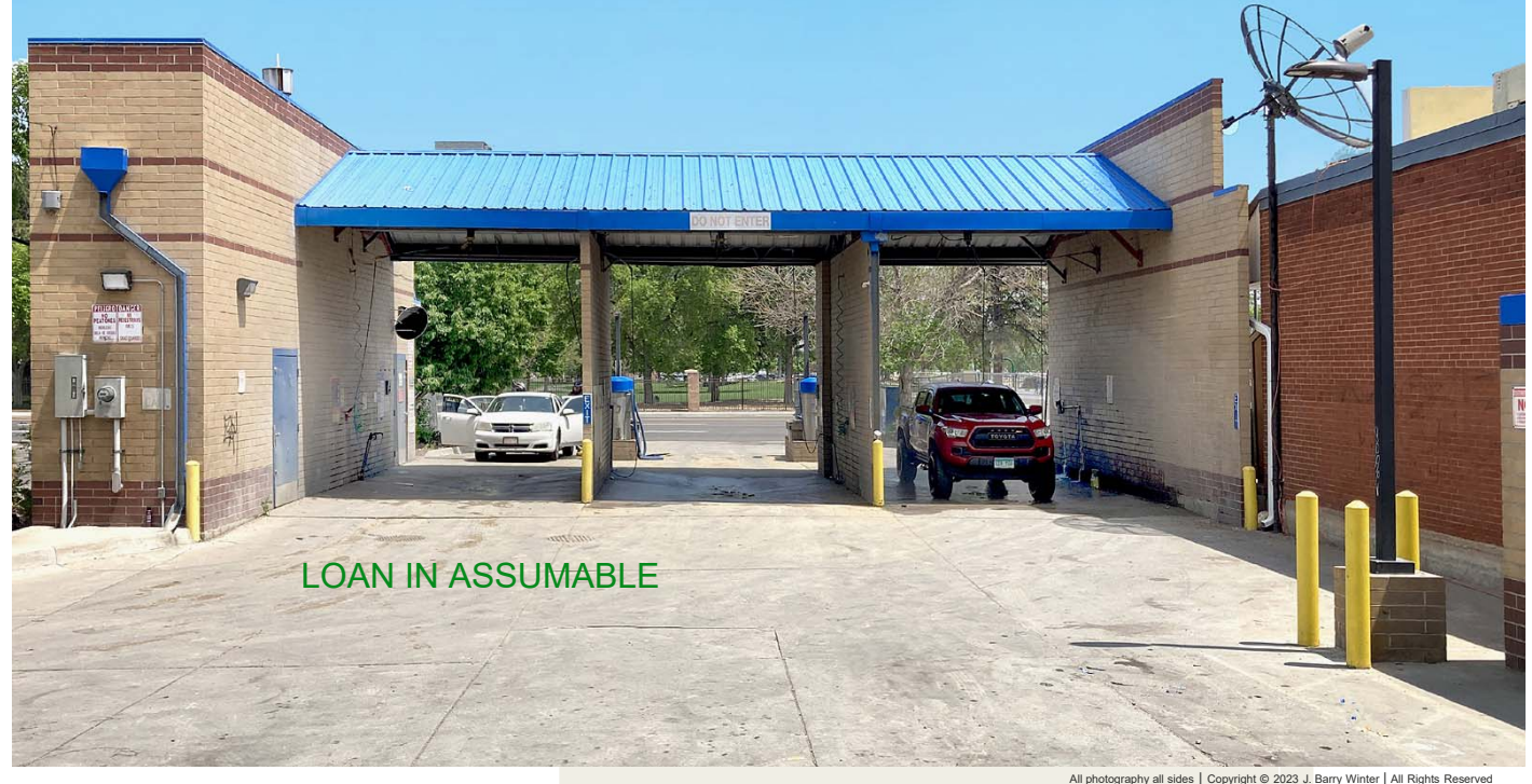
All photography all sides | Copyright © 2023 J. Barry Winter | All Rights Reserved

In a little over a decade, nearby East Colfax and surrounding areas have been brought to Life with a vengeance