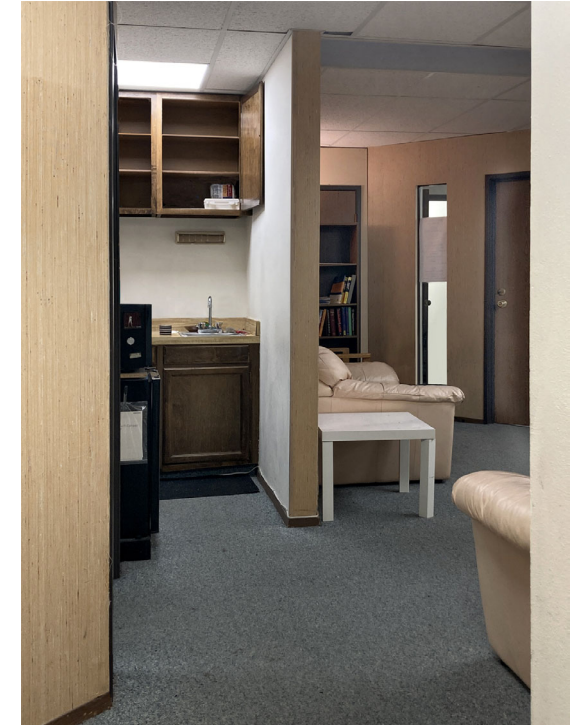
All photography all sides | Copyright © 2025 J Barry Winter. All Rights Reserved.