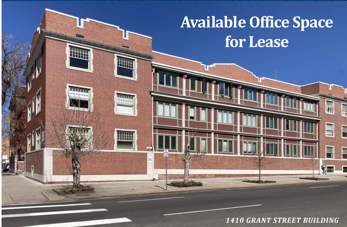
1410 GRANT STREET BUILDING