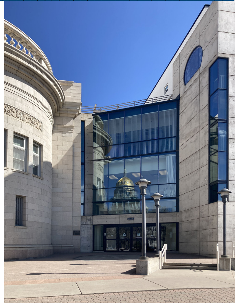
1370 GRANT STREET BUILDING