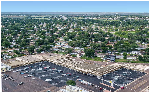
all photographic-imagining | Copyright © 2024 J. Barry Winter | All Rights Reserved