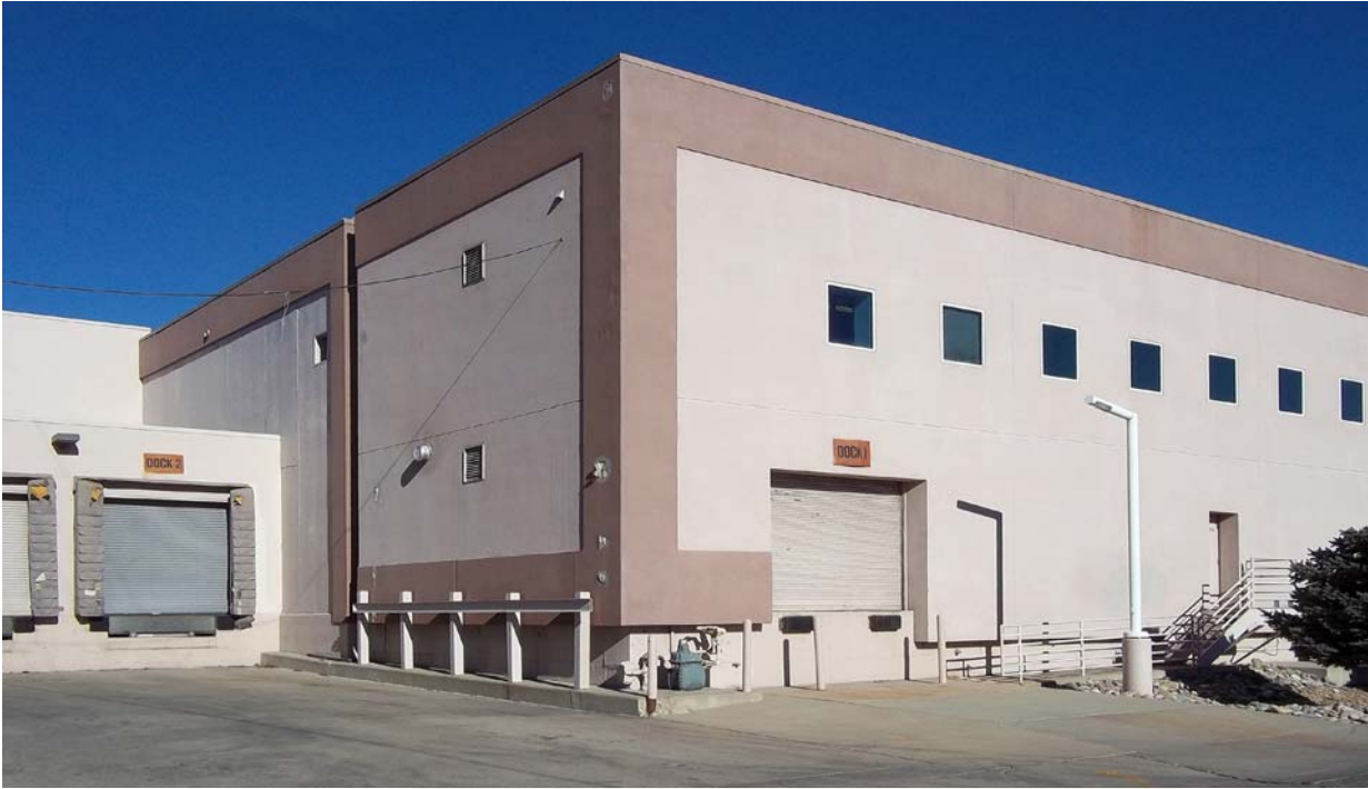
All photography both sides | Copyright © 2014 by J. Barry Winter | All Rights Reserved