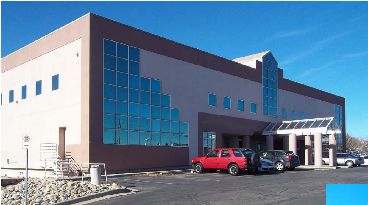
All photography both sides | Copyright © 2014 by J. Barry Winter | All Rights Reserved